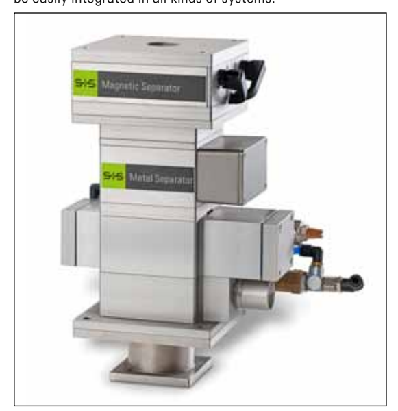
The SAFEMAG inline magnet also can be used as an optional add-on for the PROTECTOR metal separator.

By way of adaptor plates the SAFEMAG magnet system can be easily integrated in all kinds of systems.