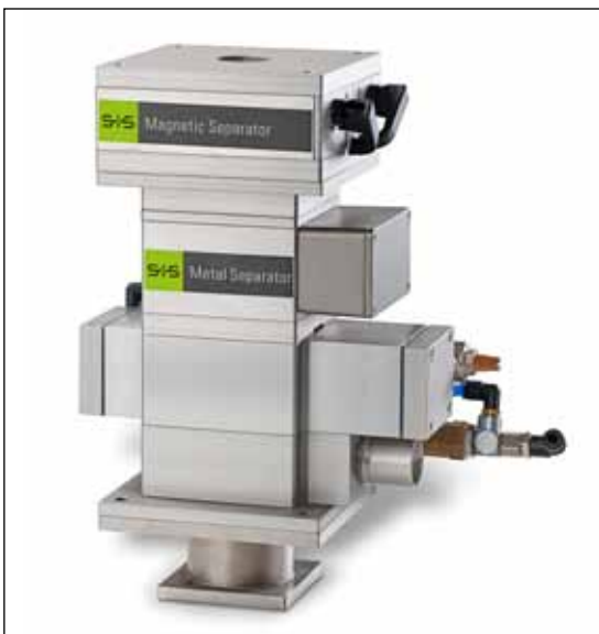
The SAFEMAG inline magnet also can be used as an optional add-on for the PROTECTOR metal separator.

If you need more detailed information ask for our technical data sheet or a discussion with our experienced S+S Sales team.